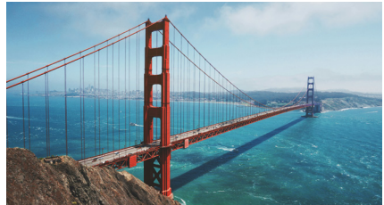
California & Arizona | November