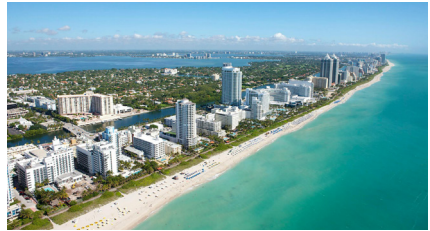
Florida | June