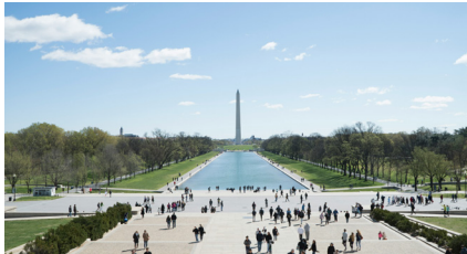
Maryland & Washington DC | September