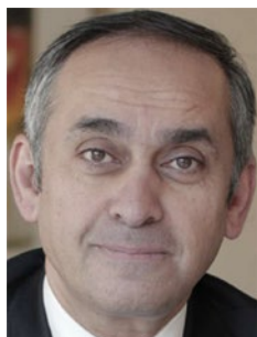
Lord Ara Darzi Paul Hamlyn Chair of Surgery, Imperial College

Professor Darzi holds the Paul Hamlyn chair of surgery at Imperial College, London, the Royal Marsden Hospital and the Institute of Cancer Research. He is director of the Institute of Global Health Innovation at Imperial College, London and an honorary consultant surgeon at Imperial College Hospital NHS Trust.